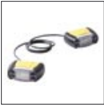
Confined space communications