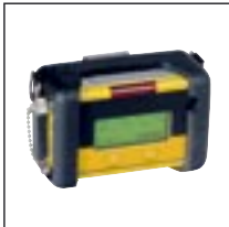
Multi-gas detector with “voice” assist for added safety